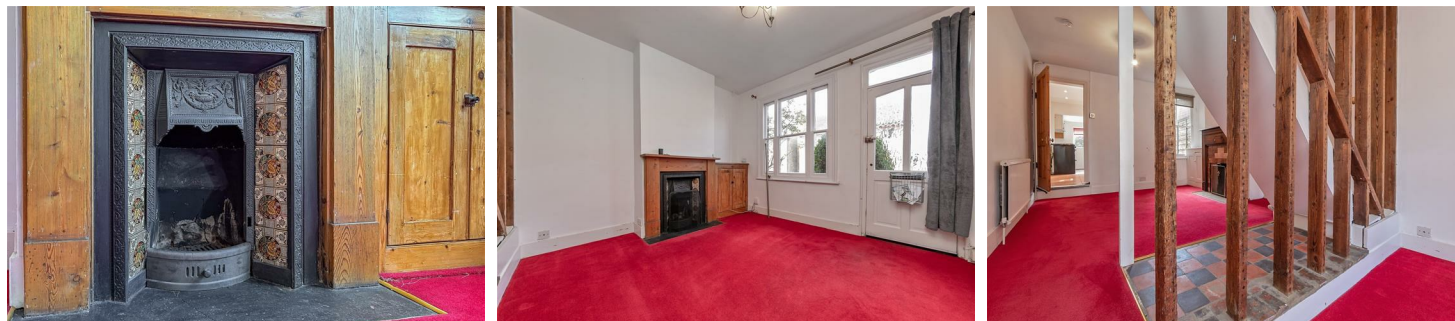
Ground Floor Approx. 396.6 sq. feet

Nestled in the heart of St. Albans on Cannon Street, this charming terraced cottage presents a wonderful opportunity for those seeking a home with character and potential. With two spacious reception rooms, this property offers ample space for both relaxation and entertaining. The two double bedrooms provide comfortable accommodation, making it ideal for couples, small families, or even as a rental investment. The cottage features a well-appointed bathroom, ensuring convenience for daily living. While the property requires some modernisation, this presents a unique chance for the new owner to personalise the space to their taste and style. The private rear garden is a delightful addition, offering a tranquil outdoor retreat for gardening enthusiasts or a perfect spot for al fresco dining during the warmer months. Being chain-free, this property allows for a smooth and efficient purchase process. Its prime location close to the city centre means that residents can enjoy easy access to a variety of shops, restaurants, and local amenities, as well as excellent transport links for commuting. In summary, this terraced cottage on Cannon Street is a fantastic opportunity for those looking to create their dream home in a vibrant and sought-after area of St. Albans. With its blend of charm, potential, and convenience, it is not to be missed.